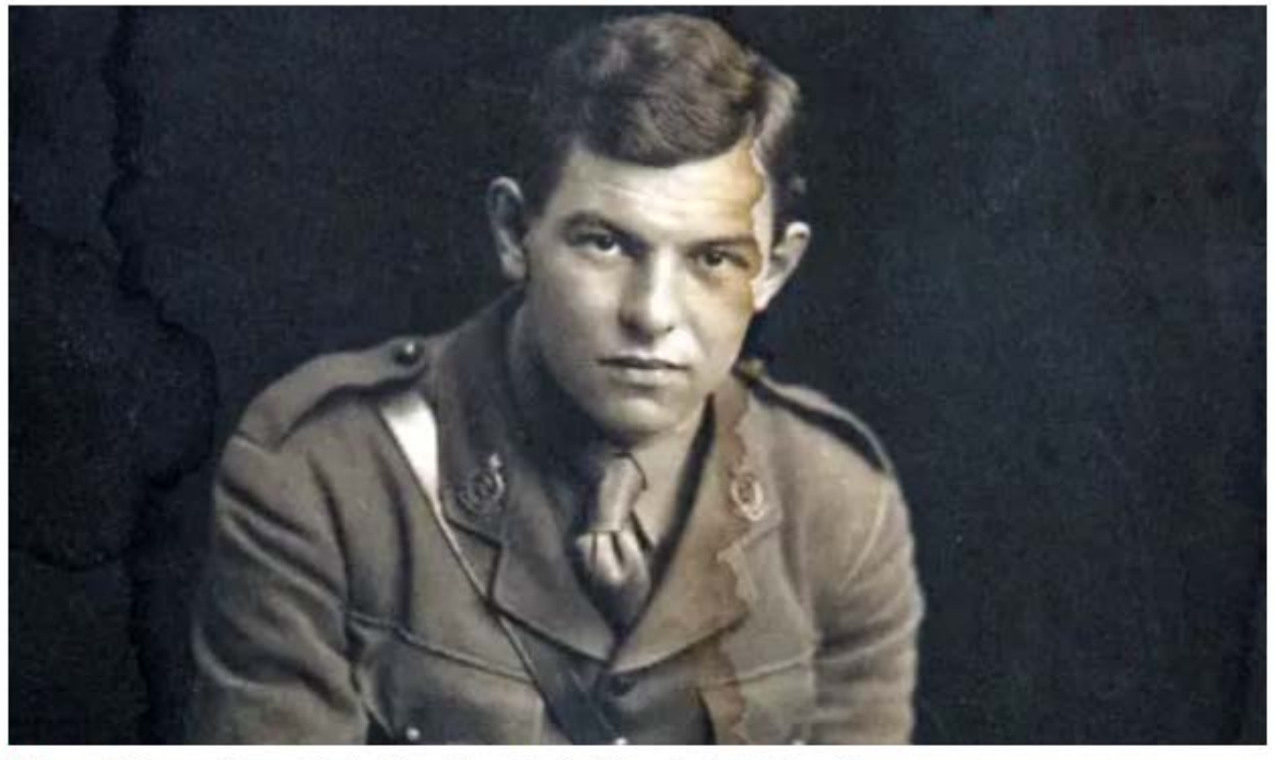
▲ Howard Somervell served in the Royal Army Medical Corps in the first world war.

Family of Theodore Howard Somervell recall the achievements of mountaineer honoured with Olympic gold in 1924