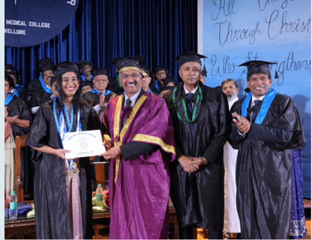
Best Outgoing Student