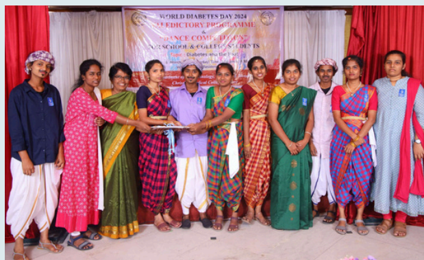
Dance: School category-3rd prize- LFC Girls Higher Secondary School