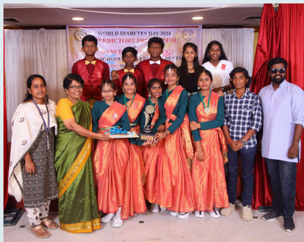
Dance: School category- 1st Prize -Kingston International Academy