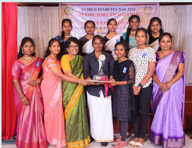
Dance: College category-3rd prize- St. John's School of Nursing