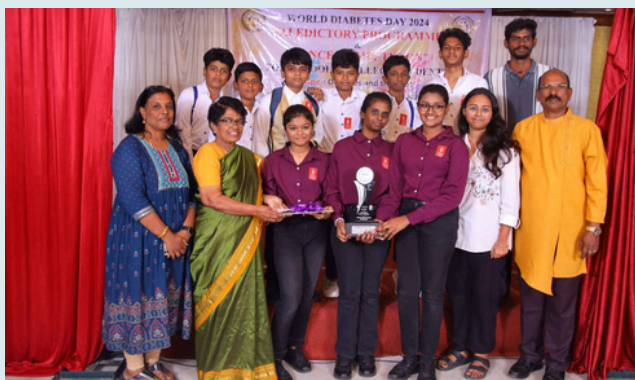
Dance: School category- 2nd Prize-Lakshmi Garden School