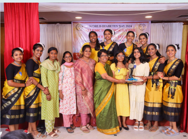
Dance: College category- 1st Prize-CMC Vellore Chittoor Campus

Link to photo gallery: https://www.cmcendovellore.org/world-diabetes-day-celebration-php/