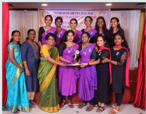
Dance: College category-2nd Prize- Dr. Vimal College of Nursing